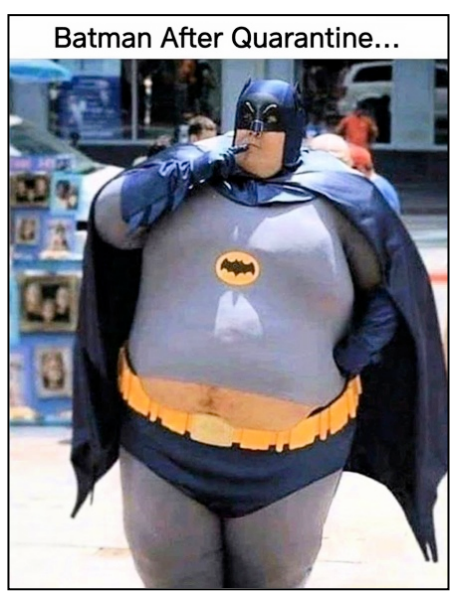
July 11/12, 2020 • Page 03